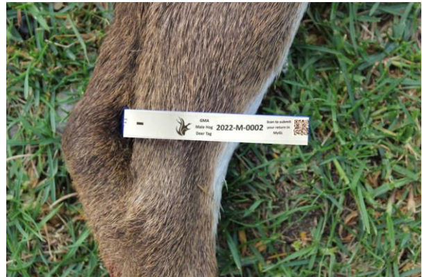
Hog Deer tag correctly locked in position around bone.

The tag pack system has changed recently. Hog Deer tag packs can only be obtained through the GMA website. Plan ahead as tag packs are no longer available for collection from Victorian Government offices.