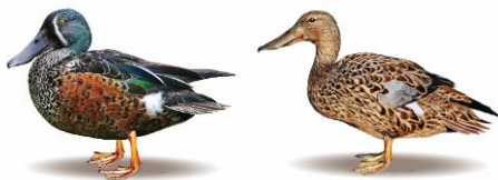
Male (left) and female (right) Blue-winged Shoveler

The Blue-winged Shoveler must not be hunted in 2022.